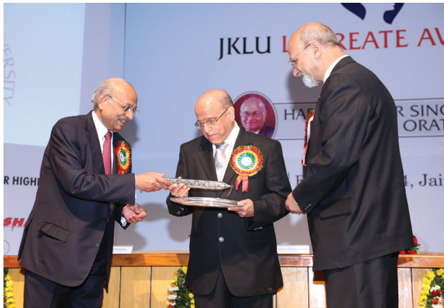
Dr. K. Kasturirangan, former Member of Rajya Sabha and former Chairman of the Indian Space Research Organisation, receiving the JKLU Laureate Award 2014 from Shri Bharat Hari Singhania, President, JK Organisation & Chancellor, JKLU.

Since 2014, JKLU is honouring nationally and internationally acclaimed and outstanding achievers with JKLU Laureate Award each year not only to venerate these accomplished leaders from all walks of life but also to facilitate the young minds in our country to identify their role models and emulate them.