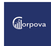
Business/ Finance Club